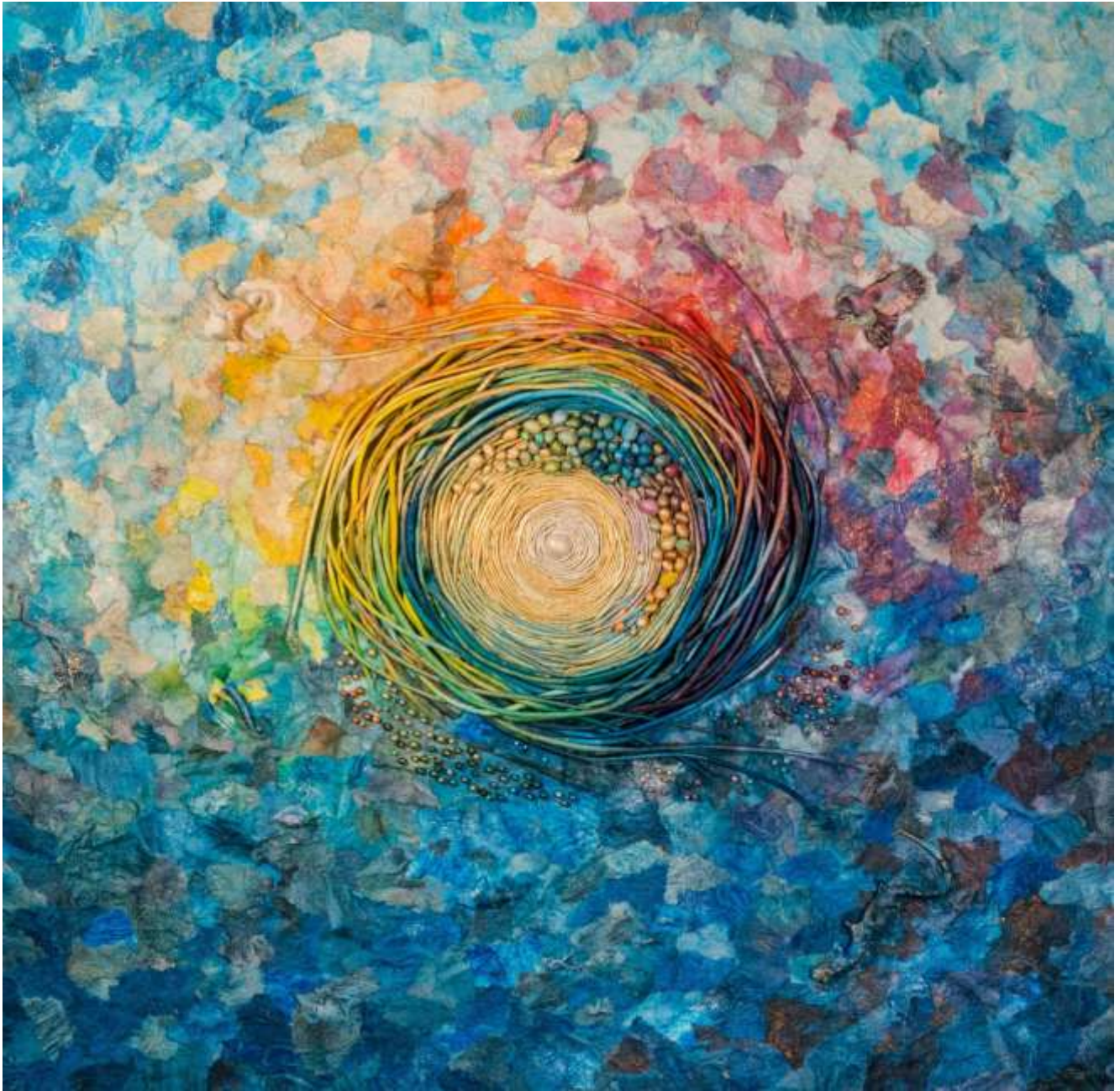
The Swarms / Songs of Praise