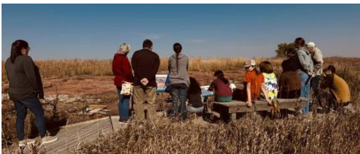
(Continued on next page)

This past weekend I was able to witness parents surround their children with love. I watched a dad and daughter work as a team to dig up potatoes from the garden before the frost sets in. I delighted in observing a mom and daughter duo harvest lavender together, stopping to literally smell the flowers while they worked. These moments will be a part of the memories that will nurture a sense of love and belonging as we move forward in our confirmation programming. And I had the pleasure of catching glimpses of the students becoming better friends to each other. I am hopeful and prayerful that God will show up through this love!